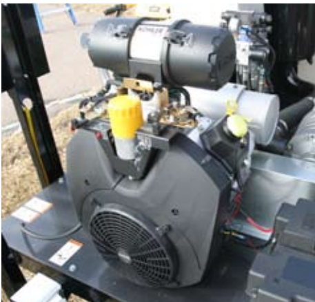
Powerful Engine Options - Gas