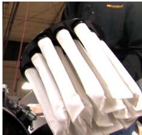
Microfiber filtering system