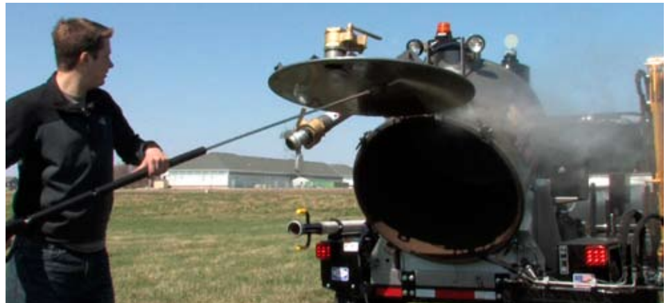
Easy clean up and dumping