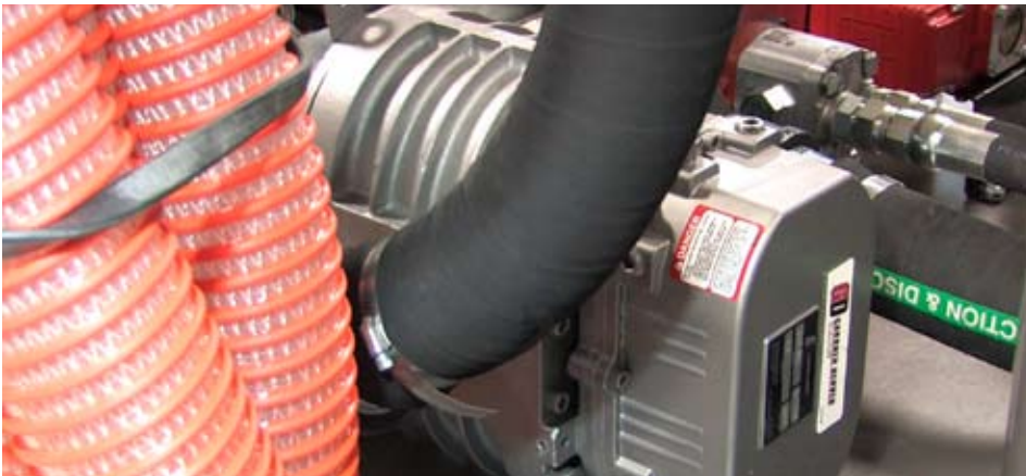
Gardner Denver Vacuum Pump