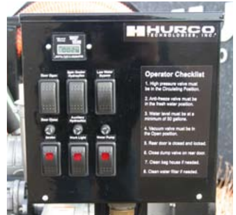
Easy-to-operate control panel