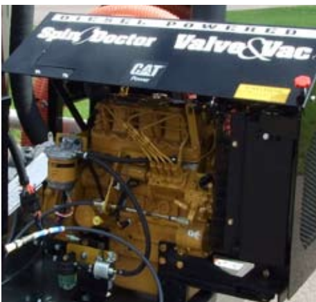
Powerful Engine Options - Diesel

For video demonstration and specifications go to www.gethurco.com