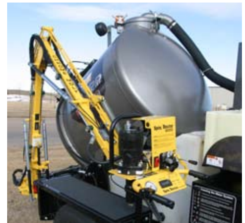
Valve & Vac unit when teamed with HURCO's Spin Doctor valve and hydrant exerciser.