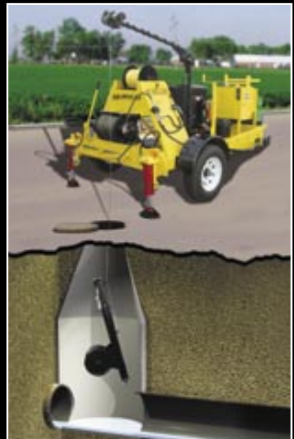
Heavy duty boom assembly with electric winch to lower equipment into a manhole.